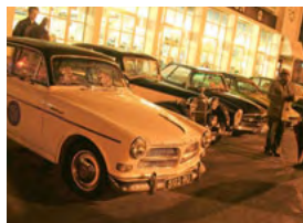
Classic Car Club Volvo Amazon

The next Ace classic car nights are on April 13 and May 11. See www.ace-cafe-london.com or call 020 8961 1000 for directions.