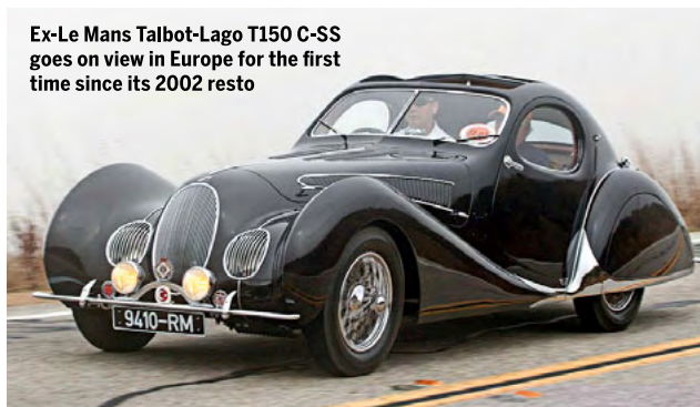
Ex-Le Mans Talbot-Lago T150 C-SS goes on view in Europe for the first time since its 2002 resto