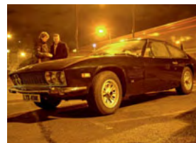
Monteverdi High Speed 375L